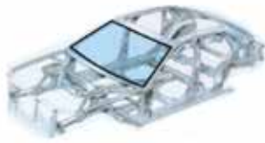
Urethane Adhesives for glass bonding systems