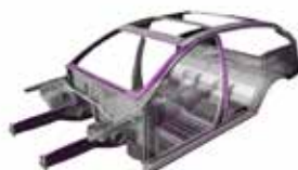
Structural Adhesives for lightweighting and safety