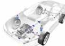
Specialty Adhesives for NVH for more enjoyable ride and durability