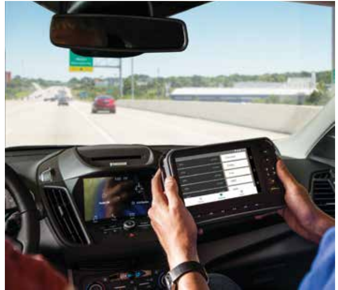
BETASEAL™ Adhesives feature a fast MDAT, allowing recalibration to be performed shortly after setting the replacement glass.

As the percentage of vehicles equipped with ADAS become more commonplace, the average installation time and cost for replacement increases. Time saved through the use of an advanced-cure adhesive can enable more replacements per shift.