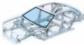
Urethane Adhesives for glass bonding systems