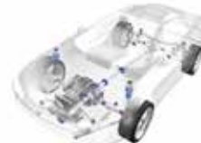
Specialty Adhesives for NVH for more enjoyable ride and durability