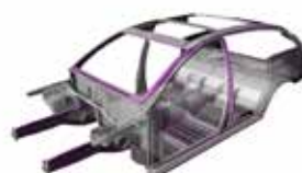
Structural Adhesives for lightweighting and safety