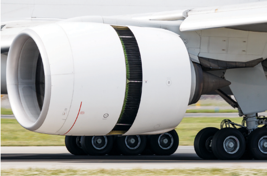
Aircraft landing with thrust reverser opening

ASB Channels Help Aircraft Thrust Reversers to Operate Longer and Safer