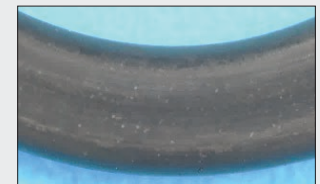
Kalrez® 7375 O-ring