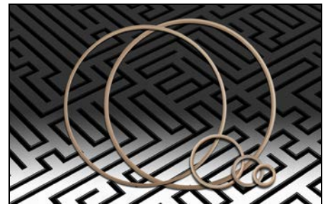
Kalrez® 9500 parts are based on a proprietary crosslinking system which is only available from DuPont.

Kalrez® 9500 also offers outstanding thermal stability, very low outgassing and excellent mechanical strength and is well suited for both static and dynamic sealing applications. A maximum application temperature of 310°C (590°F) is suggested. Kalrez® 9500 can also withstand short-term excursions up to 325°C (617°F). Ultrapure post-cleaning and packaging is standard for all Kalrez® 9500 parts.