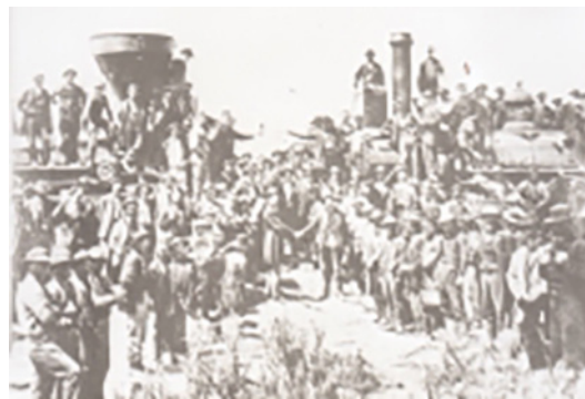
The joining of the Union Pacific and Central Pacific Railroad lines in 1869 created the first rail link between the east and west coasts of the United States.