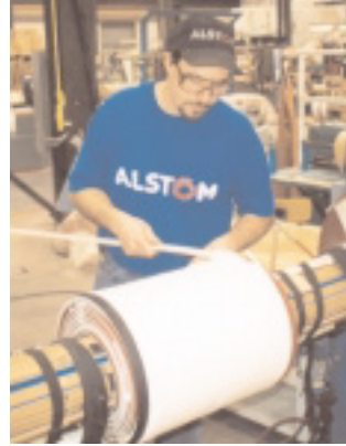
Manufacture of transformer coils at Alstom's Medford plant. Nomex® paper and pressboard are used for the ultrasonically welded cooling ducts and Nomex® paper for the conductor insulation.

On the H Class transformers designed and manufactured by Alstom for the Acela Express, Nomex® paper is used to cover the copper windings on the coils, while Nomex® pressboard is used for the spacers that separate the coil layers and act as guides for the silicone cooling oil in which the internal transformer components are immersed.