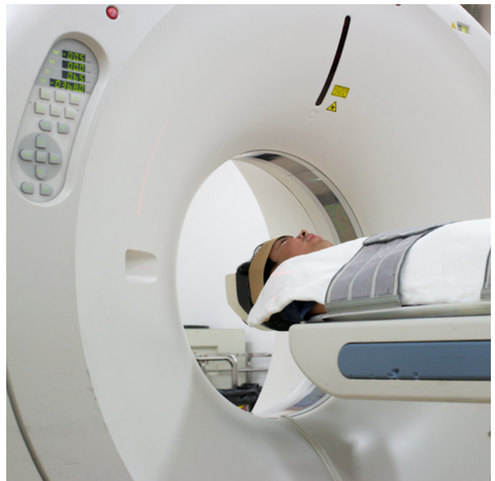
MRI Scanners require radiation-resistant seals