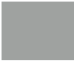
Granite gray TGY15BL3