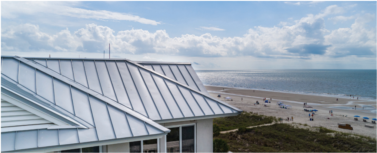
Seacrest Resort in Hilton Head, SC

Tedlar® PVF film delivers long-lasting protection and beauty across a number of applications, including metal laminates, membrane fabric structures and sound barriers. With more than 50 years of proven performance in commercial applications, Tedlar® film is the right choice for those that desire durability and aesthetic appeal.