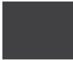
Matte Black TCC15BL3