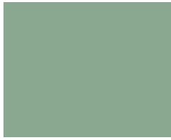
Spruce green TLG15BL3