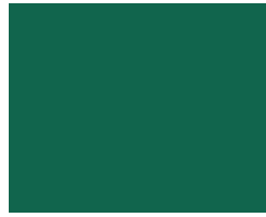
Highway Green THG15BL3