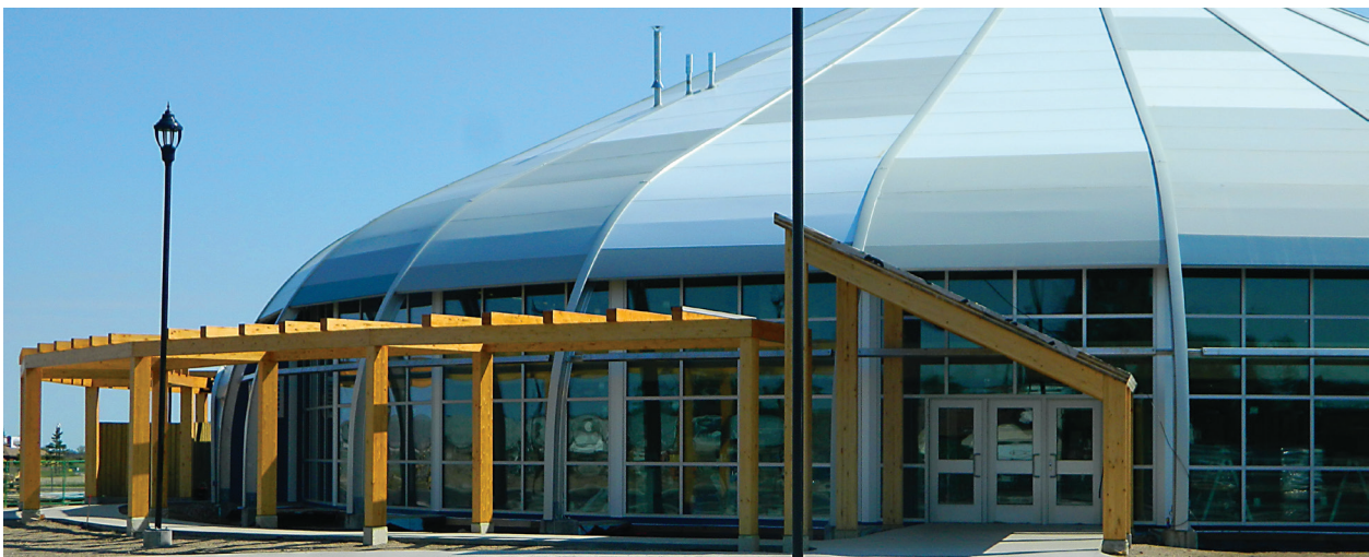
Martensville Athletic Pavilion, Canada