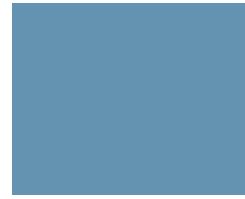
High sky THS15BL3