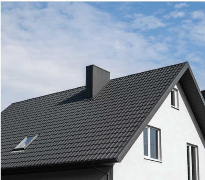
Tedlar® PVF film is available in many colors for roofing or facades.

These critical qualities are warranted upon appropriate adhesion of Tedlar® PVF film independently of the substrate and the application process. This represents a distinct advantage compared to paint, which requires careful control of the substrate preparation, the application process and the paint formulation and storage conditions.