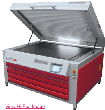
View Hi Res Image

State-of-the-Art Exposure, Light Finisher and Post Exposure Unit