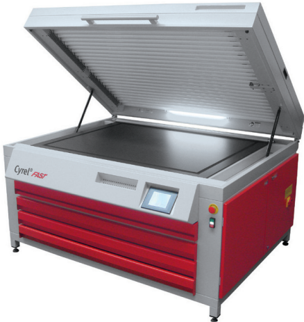
DuPont™ Cyrel® 1000 ECLF

State-of-the-Art Exposure, Light Finisher and Post-Exposure Unit