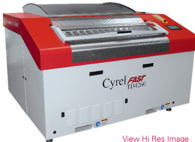
View Hi Res Image