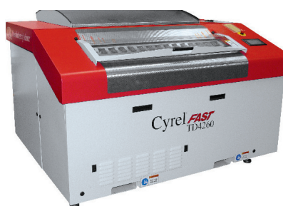
DuPont™ Cyrel® FAST 4260 TD