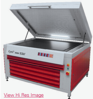
View Hi Res. Image