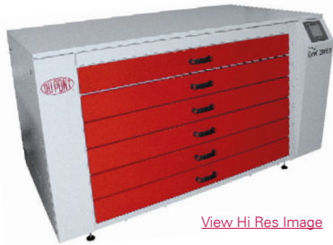
View Hi Res Image