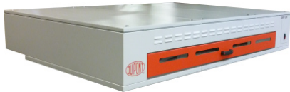
DuPont™ Cyrel® 2000 LF

DuPont Packaging Graphics continues to be a global technology leader in the development and supply of flexographic printing systems. Our R&D team continues to develop innovative new solutions to help our customers expand their business by taking advantage of new and profitable opportunities in the growing flexographic packaging market. The DuPont Packaging Graphics portfolio of products includes DuPont™ Cyrel® brand photopolymer plates (analog and digital), Cyrel® platemaking equipment, Cyrel® round sleeves, Cyrel® plate mounting systems and the revolutionary Cyrel® FAST thermal system.