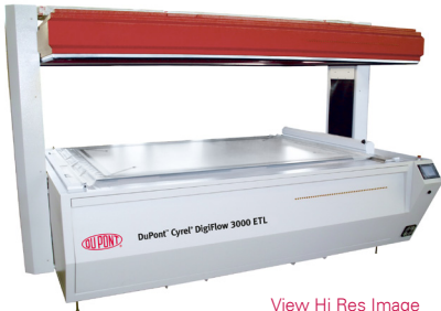
View Hi Res Image