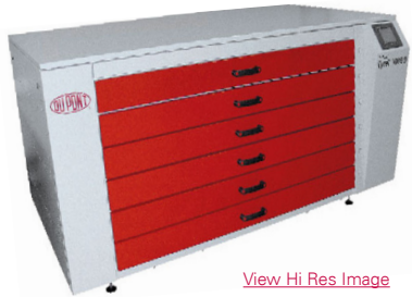
View Hi Res Image