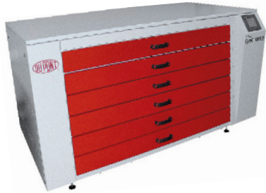
DuPont™ Cyrel® 3000 D

DuPont Packaging Graphics continues to be a global technology leader in the development and supply of flexographic printing systems. Our R&D team continues to develop innovative new solutions to help our customers expand their business by taking advantage of new and profitable opportunities in the growing flexographic packaging market. The DuPont Packaging Graphics portfolio of products includes DuPont™ Cyrel® brand photopolymer plates (analog and digital), Cyrel® platemaking equipment, Cyrel® round sleeves, Cyrel® plate mounting systems and the revolutionary Cyrel® FAST thermal system.