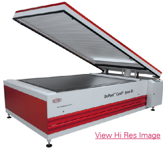
View Hi Res Image