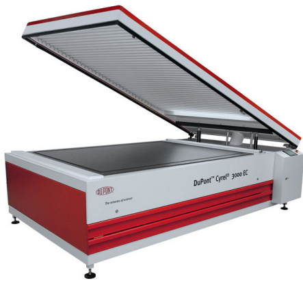
DuPont™ Cyrel® 3000 EC