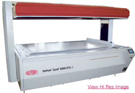
View Hi Res Image