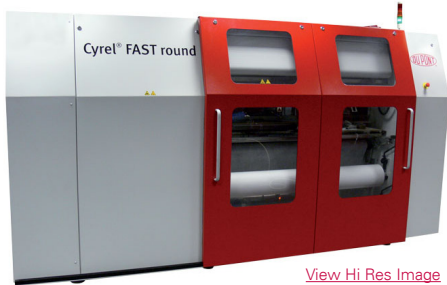
View Hi Res Image