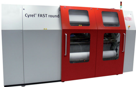
DuPont™ Cyrel® FAST Round FR 1450