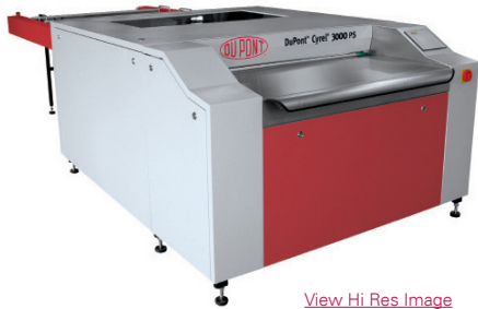
View Hi Res Image