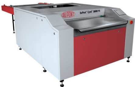
DuPont™ Cyrel® 3000 PS

DuPont Packaging Graphics continues to be a global technology leader in the development and supply of flexographic printing systems. Our R&D team continues to develop innovative new solutions to help our customers expand their business by taking advantage of new and profitable opportunities in the growing flexographic packaging market. The DuPont Packaging Graphics portfolio of products includes DuPont™ Cyrel® brand photopolymer plates (analog and digital), Cyrel® platemaking equipment, Cyrel® round sleeves, Cyrel® plate mounting systems and the revolutionary Cyrel® FAST thermal system.