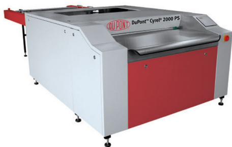
DuPont™ Cyrel® 2000 PS