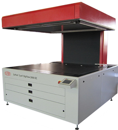
DuPont™ Cyrel® DigiFlow 2000 EC