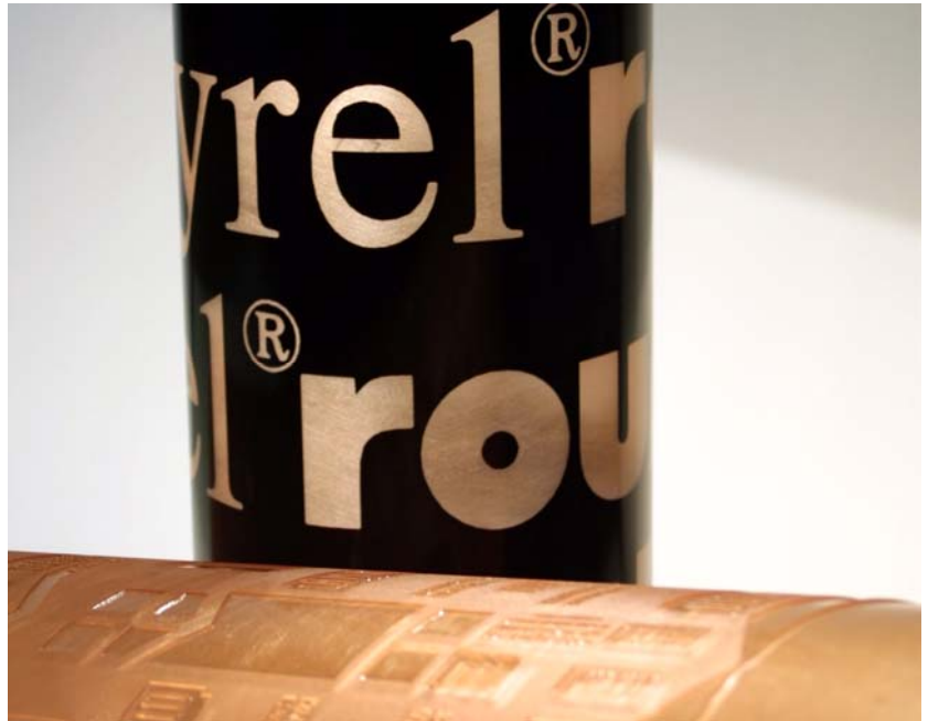
DuPont Cyrel® round Classic

The rugged base and robust polymer makes the Cyrel® round digital Classic ideal for linework, text and continuous background colors. The Classic sleeve is also suitable for tints and halftones when using lower screen rulings.