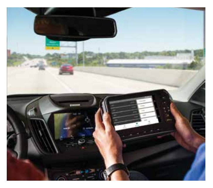
BETASEAL™ Adhesives feature a fast MDAT, allowing recalibration to be performed shortly after setting the replacement glass.

As the percentage of vehicles equipped with ADAS become more commonplace, the average installation time and cost for replacement increases. Time saved through the use of an advanced-cure adhesive can enable more replacements per shift.