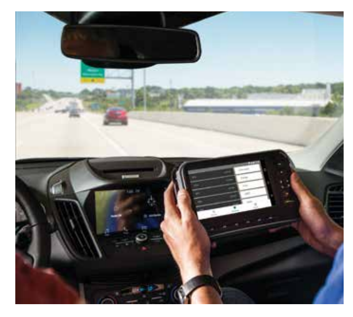
BETASEAL<sup>™</sup> Adhesives feature a fast MDAT, allowing recalibration to be performed shortly after setting the replacement glass.

As the percentage of vehicles equipped with ADAS become more commonplace, the average installation time and cost for replacement increases. Time saved through the use of an advanced-cure adhesive can enable more replacements per shift.