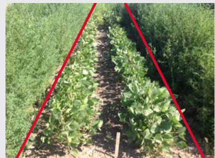
DuPont PRE herbicide followed by glyphosate + dicamba postemergence