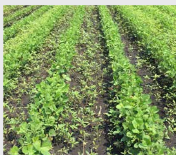
DuPont PRE herbicide followed by glyphosate postemergence