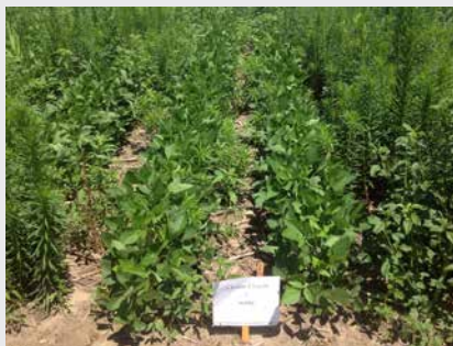
DuPont PRE herbicide + glyphosate preplant