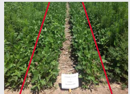
DuPont PRE herbicide + glyphosate + dicamba preplant