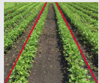
DuPont PRE herbicide followed by glyphosate + dicamba postemergence