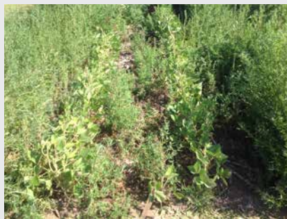
DuPont PRE herbicide followed by glyphosate postemergence