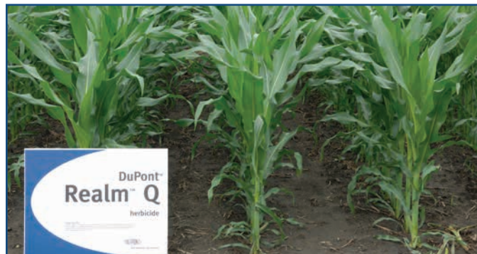
DuPont™ Cinch® followed by Realm® Q 4.0 oz/A + COC + AMS. Iowa State University, Ames, Iowa. Photo taken June 21, 2010.