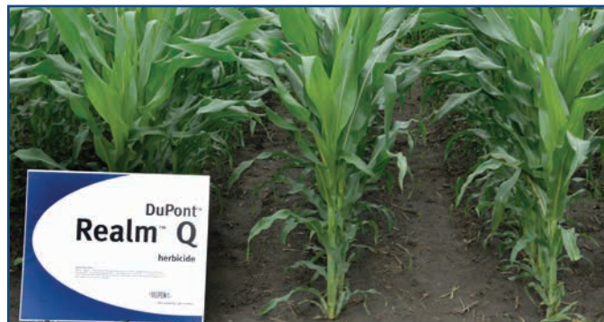
DuPont™ Prequel® 1.67 oz/A followed by Realm® Q 4.0 oz/A + COC + AMS. Iowa State University, Ames, Iowa. Photo taken June 21, 2010.