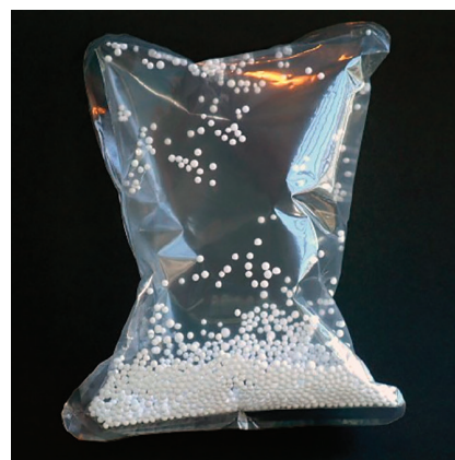
Poor Static Dissipation without Entira™ Antistat

The following demonstrates the effect of Entira™ Antistat on dusting