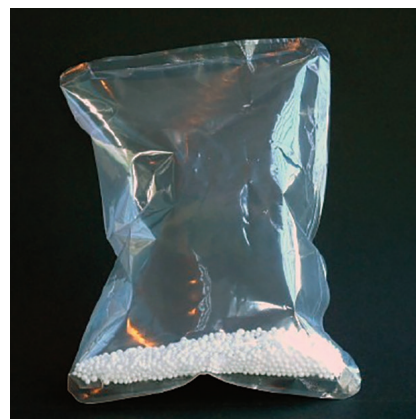
Excellent Static Dissipation with Entira™ Antistat