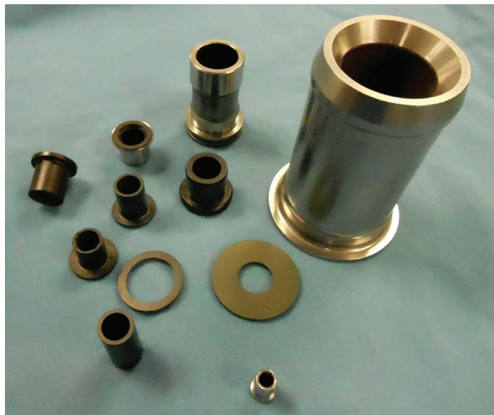
Figure 1. DuPont Vibratory Rig Wear; 475 °F/25 hr/55 lb