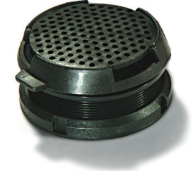
Auer Valve Cover