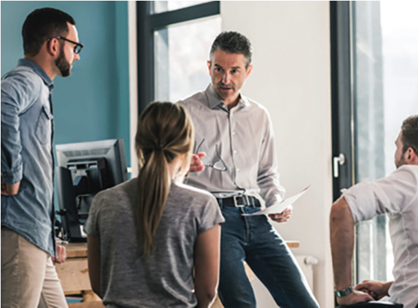
We treat our employees and all our partners with professionalism, dignity and respect, fostering an environment where people can contribute, innovate and excel.

+ Additional information can be found in Resources on the DuPont intranet.