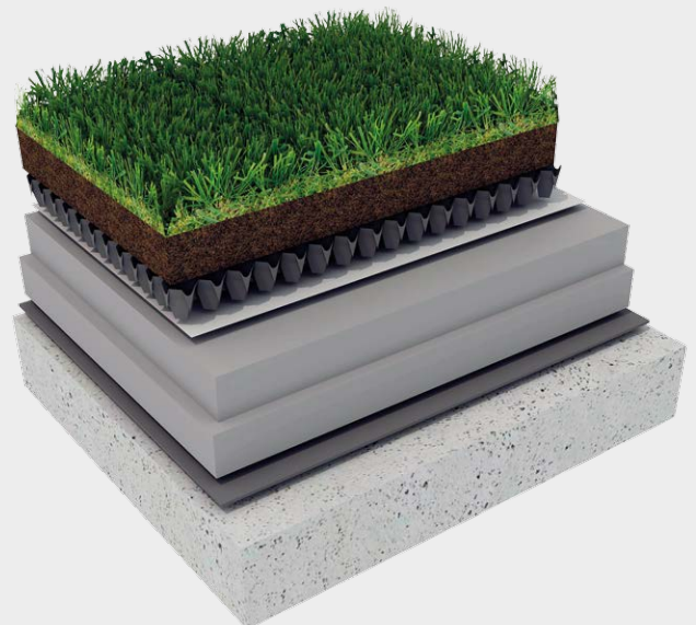
Figure 3: Inverted green roof