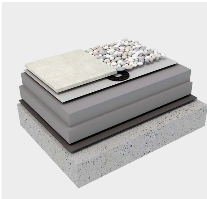
Figure 2: Inverted roof with paving ballast and inverted roof with aggregate ballast

This 'rainwater cooling effect' requires an increase in insulation thickness in order to meet BS EN ISO 6946. However, this increase can be substantially reduced by using the XENERGY™ MK system, which helps to minimise the heat loss due to rainwater cooling and therefore the amount of insulation required.