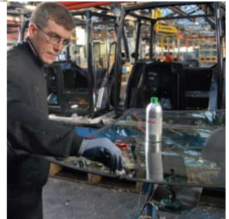
Above: Used as part of a complete glass bonding system, BETAPRIME is also used as an adhesion promoter on body surfaces in conjunction with BETAMATE™ structural adhesives.

BETAWIPE cleaners/activators are also recommended for specific substrates and applications. Used in the glass bonding process and also with semi-structural adhesive applications, BETAWIPE provides surface cleaning advantages, which help improve crosslinking and bonding.