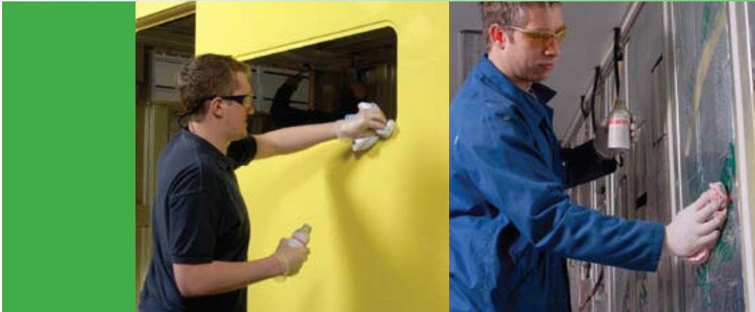
Far left: Apply BETAWIPE with a continuous movement to clean and activate surfaces as part of a complete adhesive system.

To achieve optimum results from adhesives and sealers, proper surface preparation is required so that a chemical bond can form between substrates. Specific grades of BETAPRIME™ primers and BETAWIPE™ cleaners/activators from Dow Automotive Systems are recommended as parts of complete systems for commercial vehicle manufacturing and repair processes.