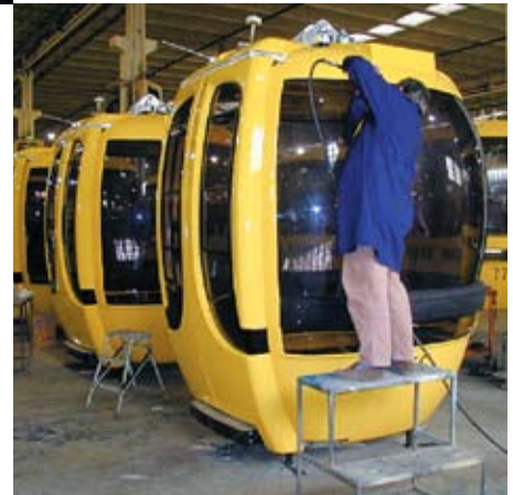
Dow Automotive Systems BETASEAL™ glass bonding systems help seal stationary glass, adding to the vehicle's structural strength and protecting the interior cabin from dirt and other environmental elements.

To ensure the best results for your assembly operations, Dow Automotive Systems recommends the correct step-by-step use of its cleaners, primers, and activators with its adhesive and sealants. Please contact a Dow representative at 1-800-441-4369 for specific surface preparation guidelines and product grades for your application.