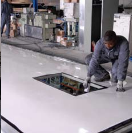
Far left: BETAFILL™ seam sealants are used for seam and panel sealing, gap filling and panel bonding.