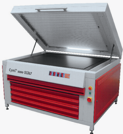
DuPont™ Cyrel® 1000 ECDLF