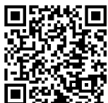
Download latest version

DuPont Packaging Graphics continues to be a global technology leader in the development and supply of flexographic printing systems. Our R&D team continues to develop innovative new solutions to help our customers expand their business by taking advantage of new and profitable opportunities in the growing flexographic packaging market. The DuPont Packaging Graphics portfolio of products includes DuPont™ Cyrel® brand photopolymer plates ( analog and digital ), Cyrel® platemaking equipment, Cyrel® round sleeves , Cyrel® plate mounting systems and the revolutionary Cyrel® FAST thermal system .