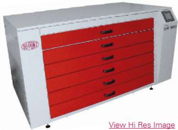
View Hi Res Image