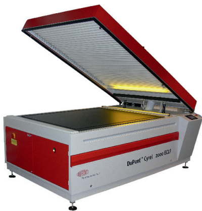
DuPont™ Cyrel® 2000 ECLF

DuPont Packaging Graphics continues to be a global technology leader in the development and supply of flexographic printing systems. Our R&D team continues to develop innovative new solutions to help our customers expand their business by taking advantage of new and profitable opportunities in the growing flexographic packaging market. The DuPont Packaging Graphics portfolio of products includes DuPont™ Cyrel® brand photopolymer plates (analog and digital), Cyrel® platemaking equipment, Cyrel® round sleeves, Cyrel® plate mounting systems and the revolutionary Cyrel® FAST thermal system.