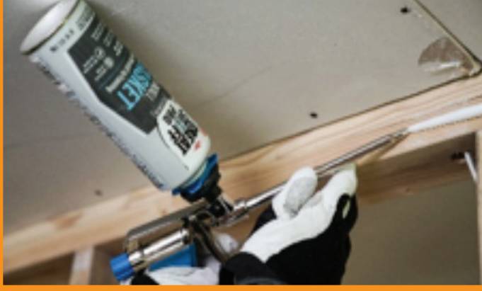
GREAT STUFF PRO<sup>™</sup> Gaske