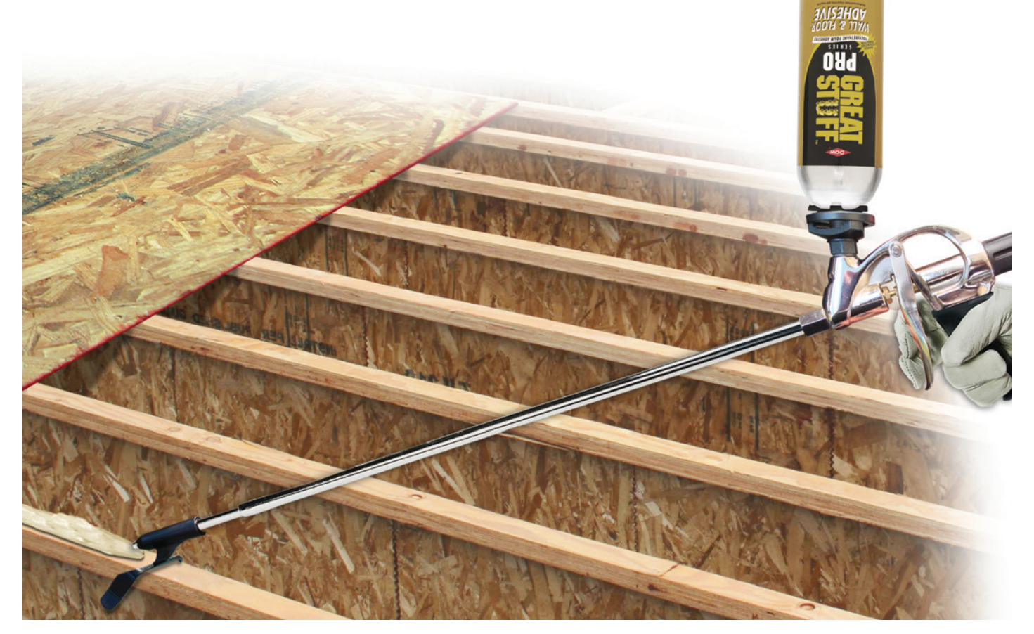
* Field demonstrated yield comparison. If theoretical yield is compared, one can of GREAT STUFF PRO<sup>®</sup> Wall & Floor Adhesive (26.5 oz/751 g) applied at1/4" bead diameter will equal up to 16 nominal quart tubes of caulk adhesive (28 oz/794 g) applied at 1/4" bead diameter.

Stand up when applying GREAT STUFF PRO<sup>™</sup> Wall & Floor Adhesive with the PRO 14XL Series long-barrel dispensing gun (40" [1 m] barrel). A guide tip, specially designed for PRO 14XL, helps control the position of the bead.