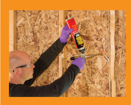
GREAT STUFF PRO<sup>™</sup> Gaps & Cracks is recognized as a fireblock, which means it resists the free passage of flames to other areas of the building through concealed spaces. The foam is a bright orange color, easily identifiable by code officials.