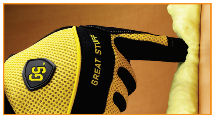
When cured, remains soft and flexible. Cured foam can be stuffed back into the gap without trimming.

*70 \pm 5 °F and 50 \pm 5 %RH, 1 inch bead diameter, 6 inch length. Cure rate is dependent on temperature, humidity, and size of foam bead. **Based on average-sized windows 36" x 60", 3/8" wide gap, and 1" deep. (US Only)