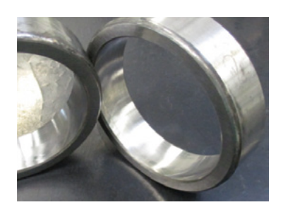
DIN 51802, 7 days, distilled water No corrosion