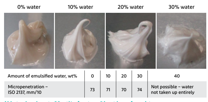
Able to absorb up to 30 wt% of water without loss of consistency