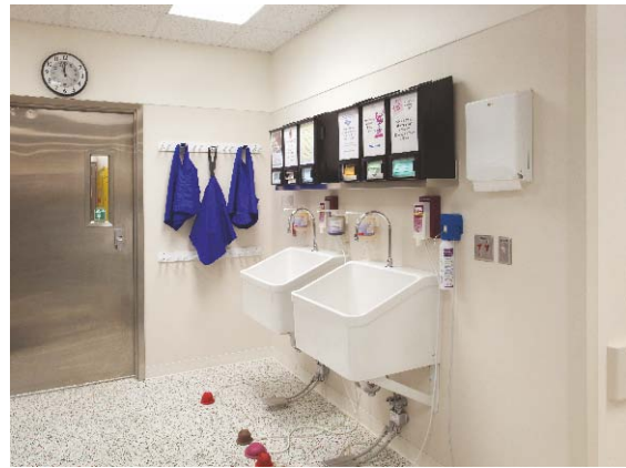
Hospital Scrubs Sinks made with DuPont™ Corian®, East Texas Medical Center

Clinicians have long had confidence in Corian® for hygiene-critical situations, and this solid, non-porous, and seam free resistance to cross-infection can also take imaginative and appealing form to enhance a sense of well being. Appropriate and thorough cleaning methods keep Corian® pure and fresh, while its non-toxic composition does not support the growth of germs, fungi or mould. This makes Corian® the sensible solution for healthcare design... from integrated sinks in laboratory work tops to scrub rooms, theatre walls, information centres, nursing stations, children's wards, cafeterias and patient facilities.