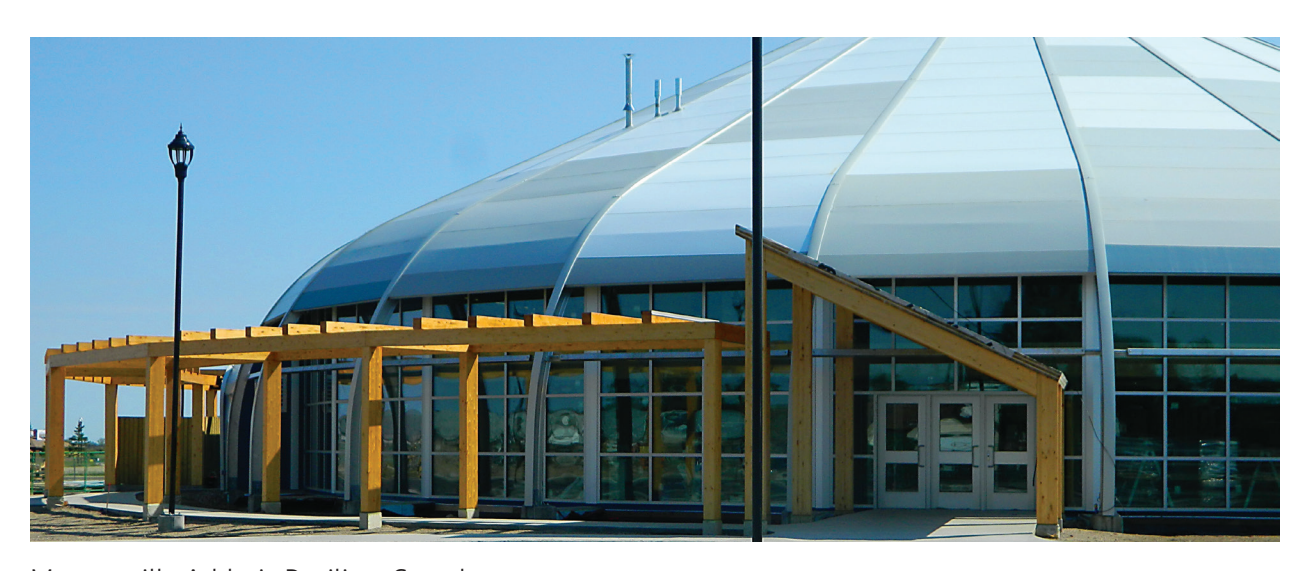
Martensville Athletic Pavilion, Canada