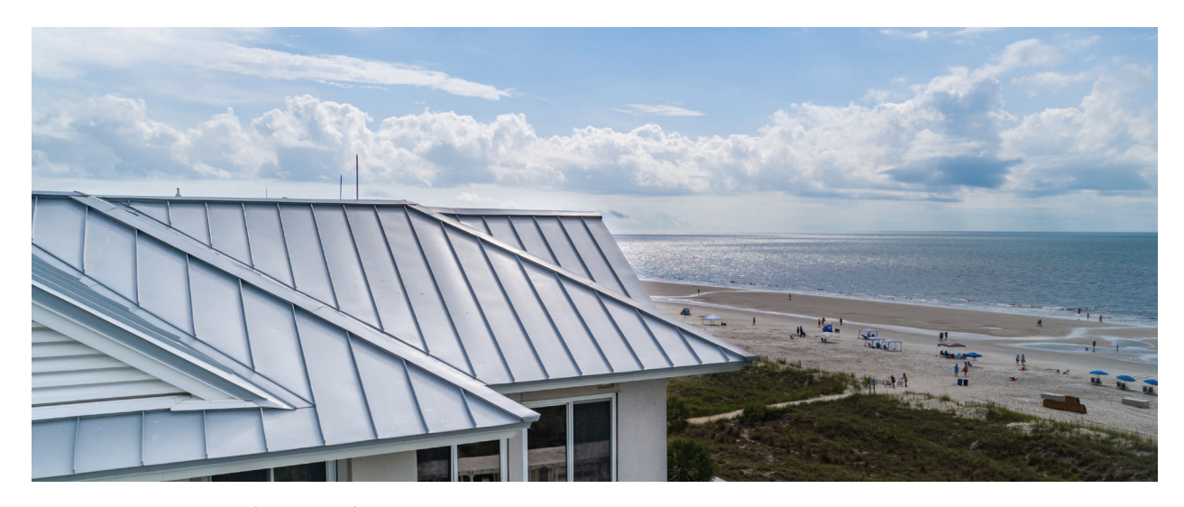
Seacrest Resort in Hilton Head, SC

Tedlar® PVF film delivers long-lasting protection and beauty across a number of applications, including metal laminates, membrane fabric structures and sound barriers. With more than 50 years of proven performance in commercial applications, Tedlar® film is the right choice for those that desire durability and aesthetic appeal.