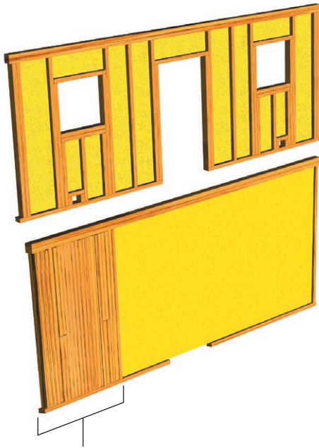
Studs account for 25 percent of the wall surface, leaving a quarter of the building with no thermal protection if an uninsulated sheathing is used.

STYROFOAM™ Brand Residential Sheathing adds up to an investment that will pay for itself in just a few years, and continue to provide value for years to come. Using STYROFOAM™ Brand Residential Sheathing could lead to fewer callbacks resulting in an enhanced reputation for builders.