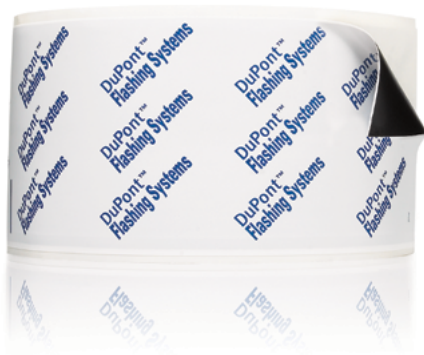
DuPont™ Flashing Tape

DuPont has recently re-evaluated the conditions and requirements for use of the various DuPont Self-Adhered Flashing Products for non-flanged windows and doors. DuPont’s typical detail for protecting the rough opening for a commercial non-flanged unit involves a flush cut of the Tyvek® WRB at the opening, a head flap above the opening, and “wrapping the cavity” with flashing by installing FlexWrap™ at the sill, StraightFlash™ at the jambs, and FlexWrap™ at the head. This detail is based on the high-performance requirements for commercial construction. However, for wood-framed construction, the building design is often not specified for high-performance.