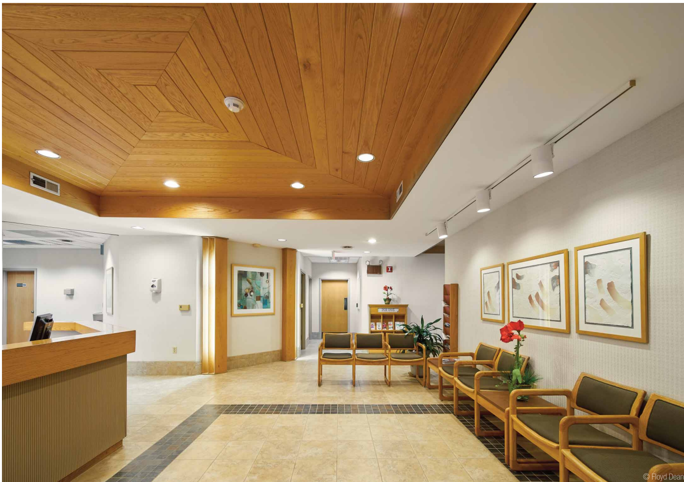
Fig. 4: Vinyl wallcovering protected with DuPont Tedlar film is used in all high-traffic areas at Omega Medical Center, Newark, Delaware, US

films have demonstrated years of real-life application performance standing up to some of the toughest of environments. A surface's ability to withstand occasional events, such as a hospital bed or a patient trolley hitting the side of a protected wall or nurse's station, is very important to a product's performance. Tedlar PVF films are used in laminate composite structures and these structures become an integral part of the final product, whether this is a piece of furniture or wallcovering.